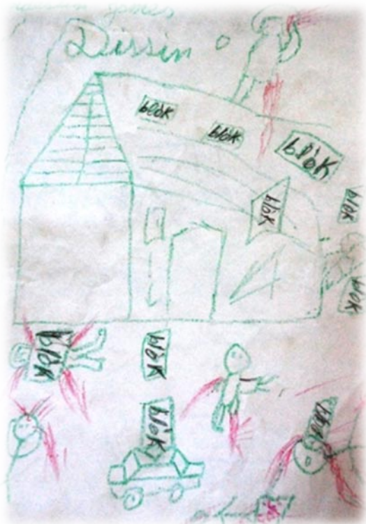
Above left, shows one youth's conception of how Haiti appeared before and after the earthquake. Drawings of cement blocks falling from houses crushing people beneath; (R) is an image of an amputee walking with crutches.